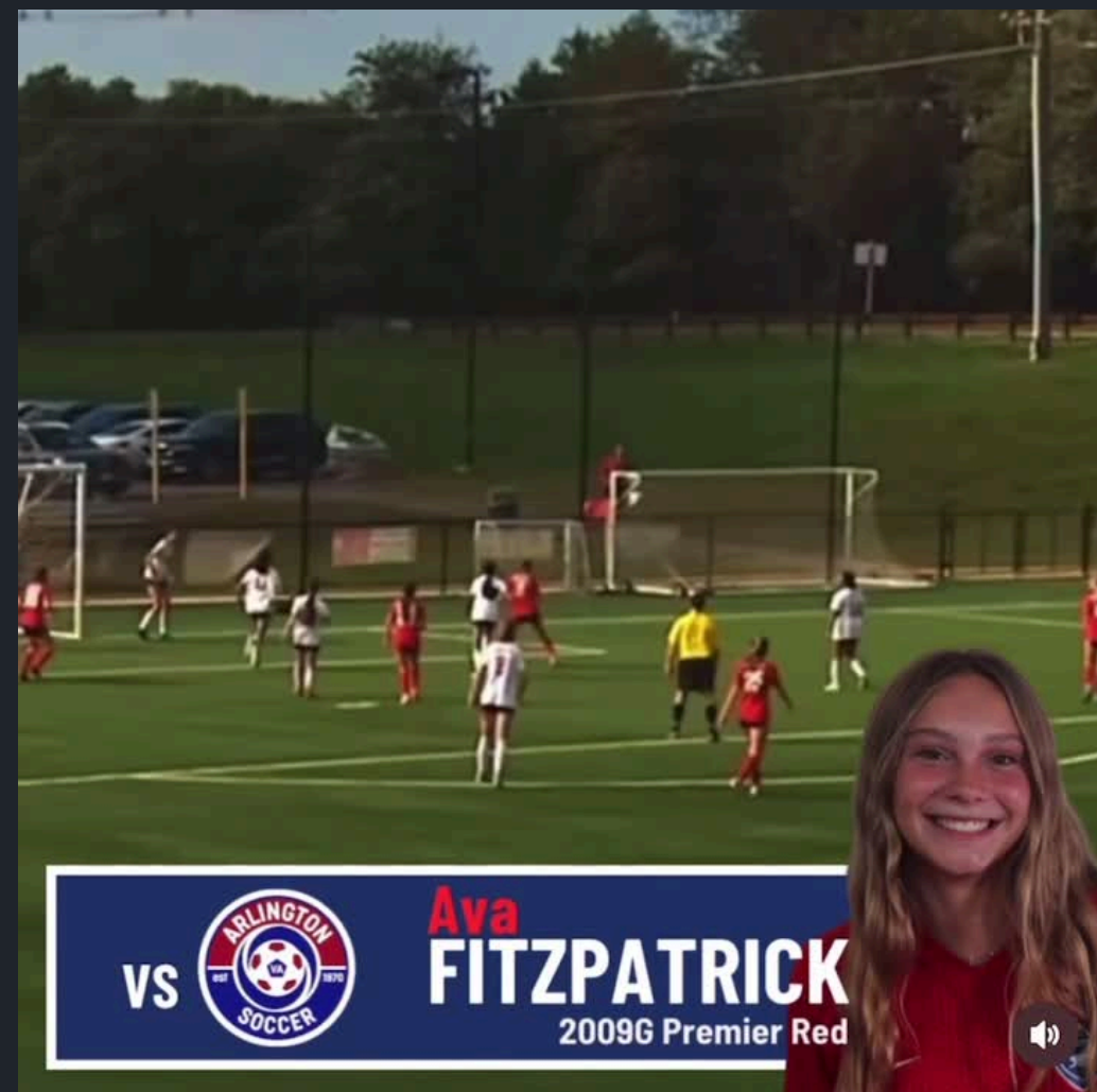
GOALS OF THE WEEK